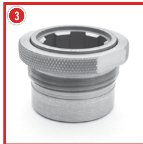
398118 - Bushing Adapter 50 Cal 392301 - Press Bushing LNL