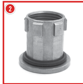
392302 - Bushing Die LNL 392303 - O-Ring LNL