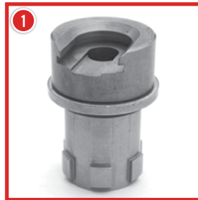
390585 - Shell Holder #50 392302 - Bushing Die LNL 392303 - O-Ring LNL

Your 50 Cal BMG press comes with the following items: