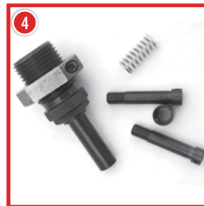
050007 - Ram Prime System 50 BMG