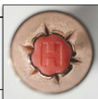
Critical DUTY® ammo features an “H” on the tip.

Critical DUTY® ammo is packaged in 50-count boxes for Law Enforcement.