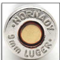
Critical DUTY® ammo features waterproof sealant around the primer.